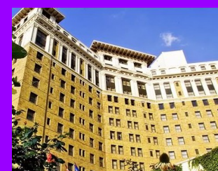
St. Paul Hotel