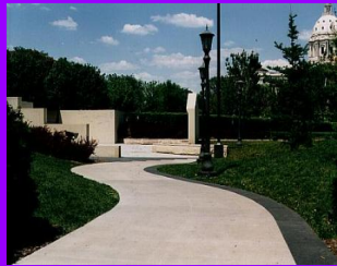
Minnesota War Memorials