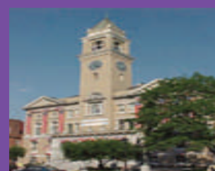
Montpelier City Hall