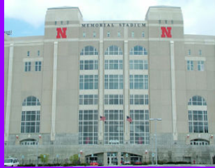
UNL Memorial Stadium