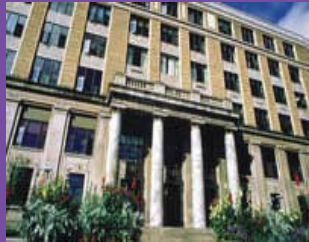
State Capitol Building