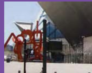
Denver Art Museum